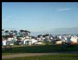
MasterCraft Exhibit at the South Wales Boat Show - 18/06/2007

The weekend of 16th / 17th June saw the South Wales Boat Show take place at the very picturesque site of Margham Park with the most sunning castle overlooking the site it truly was a great place to host a show.