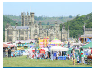
The 2006 South Wales Boat Show at Margam park, Port Talbot

With the sun beating down on the beautiful Welsh country side, it was easy to see why the organisers chose Margam Park to host the South Wales Boat Show . On the 17-18th June thousands descended on Port Talbot for the event which could mark the first in a string of regional shows. A range of attractions were offered throughout the weekend including craft demonstrations, a multitude of chandlery stalls and a wide selection of activities targeted at family entertainment.